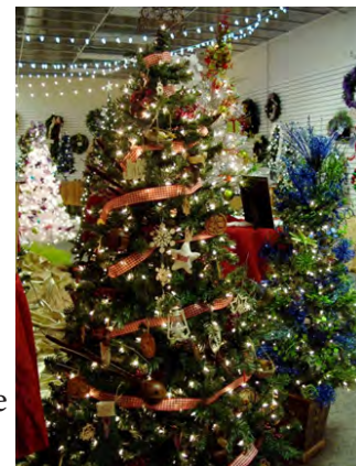
Decorated holiday trees at the 2nd Annual Take A Bough Event

The 2nd Annual Take A Bough event was held at the Galleria at Pittsburgh Mills, November 18 - 21. It was an exciting year for the Chapter, as we raised over $45,000 on this annual event. We are extremely grateful for the donations we received from our Chapter members, our partner organizations and the new donors who offered their support for the first time.